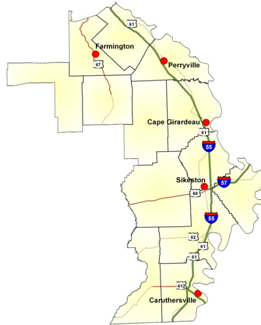
Southeast WIA Region

In 2009, 40% of all workers in the Southeast region were employed in the cities Cape Girardeau (25.5%), Farmington (11.6%), and Sikeston (9.9%) which is up slightly from 2002 when the percentage was at 37%. Other cities in the Southeast WIA with 4,000 or more jobs are Dexter City, Jackson City, and Kennett City.