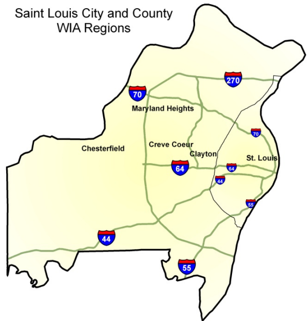
Saint Louis City and County WIA Regions

In 2009, 23.3% of all workers in the St. Louis Region were employed in the cities of Creve Coeur (7.2%), Maryland Heights (6.8%), Chesterfield (5.3%), and Clayton (4%) which is up from 2002 when these four cities made up 19.3%. Other cities in the St. Louis Region WIA with significant jobs include Bridgeton, Town and Country, and Fenton among others.